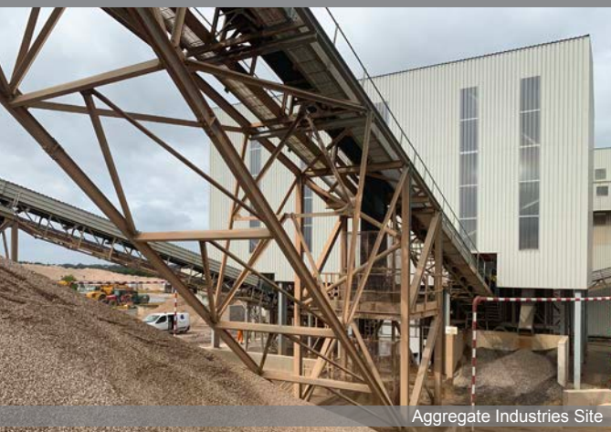
Aggregate Industries Site