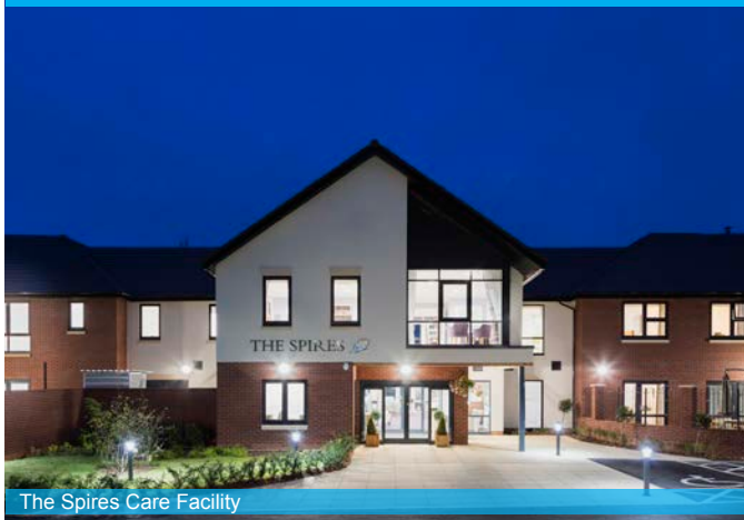
The Spires Care Facility

Structural inspections of over 150 sites annually across the UK for Aggregate Industries, manufacturer and supplier of construction and building materials, where we have an exclusive contract, surveying mixing plants, asphalt plants, buildings, bridges, offices, quarries, conveyors, etc.