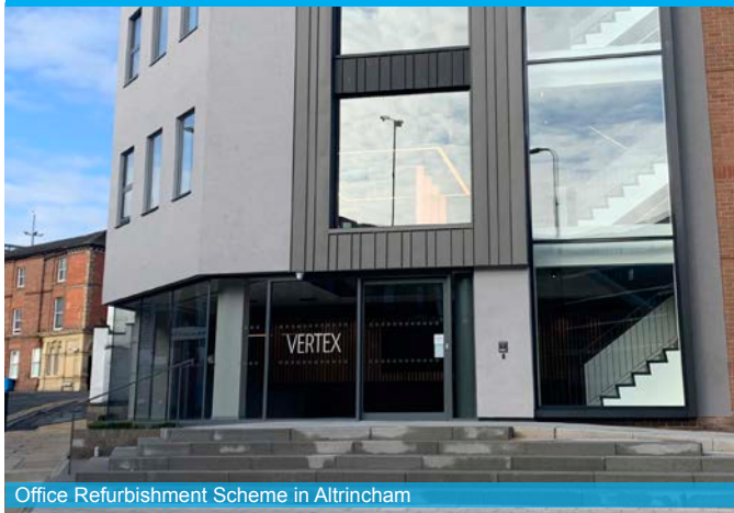
Office Refurbishment Scheme in Altrincham

A new 60,000sqft parcel delivery hub facility for DPD UK, in Chelmsford.