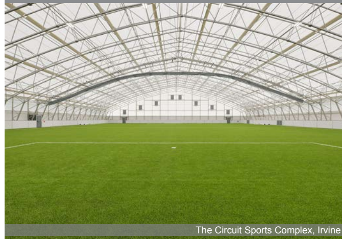
The Circuit Sports Complex, Irvine

The new training academy for newly promoted Norwich City FC completed in time for the 2019/2020 football season!