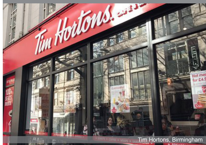
Tim Hortons, Birmingham