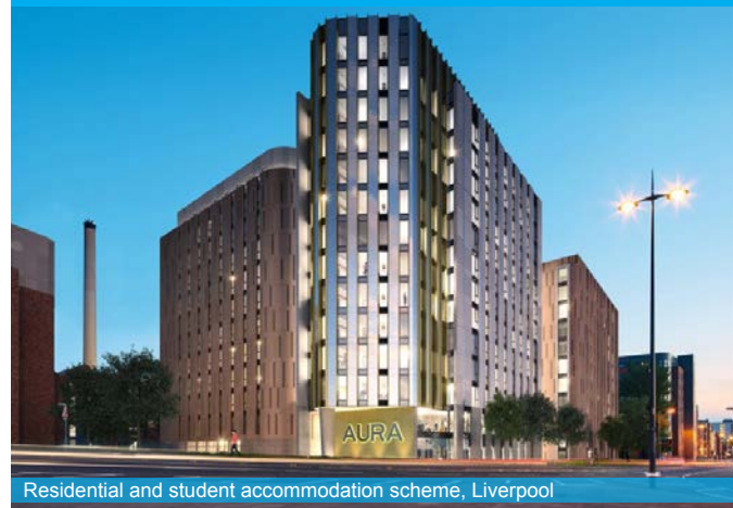
Residential and student accommodation scheme, Liverpool

We continue to provide multi-discipline services across the retail sector, including fit outs, refurbishment schemes and new build projects, on shopping centres, city centre schemes, out-of-town retail park developments, garden centres, mixed-use developments and distribution centres.