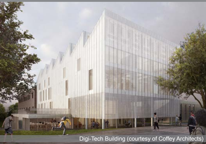
Digi-Tech Building (courtesy of Coffey Architects)

Multiple MEP appointments at the University of Westminster from the creation of a new laboratory to a large refurbishment scheme across 3 campuses.